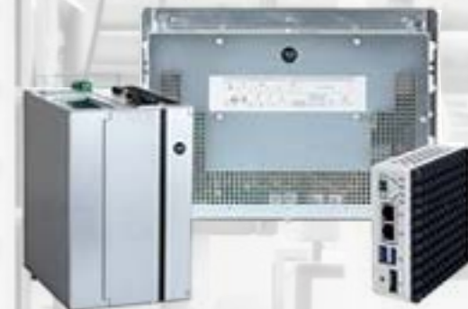
ASEM 6300B Intel Core i Class Book Mount Box PC